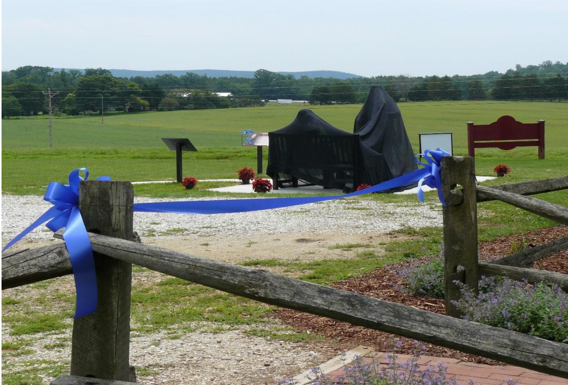
The Hamner/Fortune statues covered before the celebration