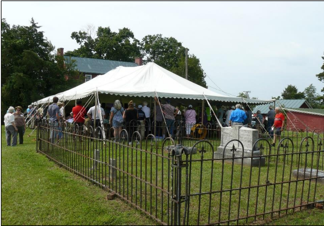
The large tent at the Nelson Co. Historical Society event