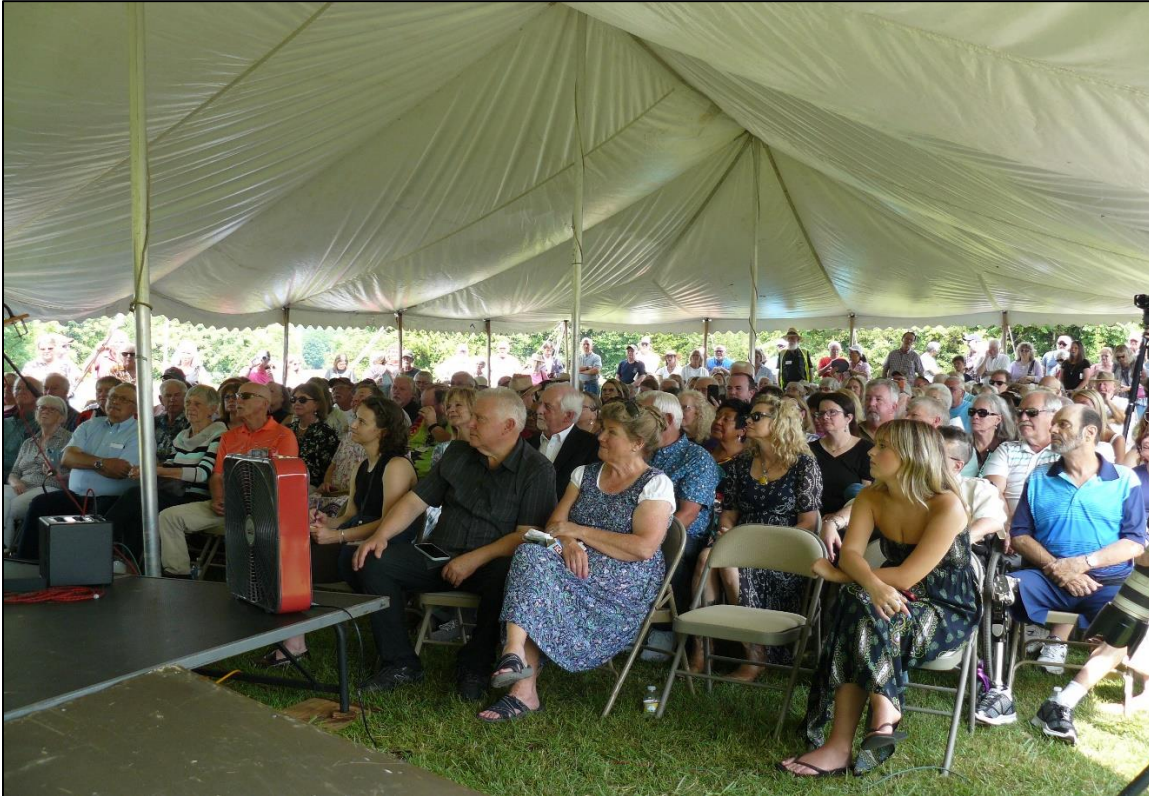
The audience listening with rapt attention