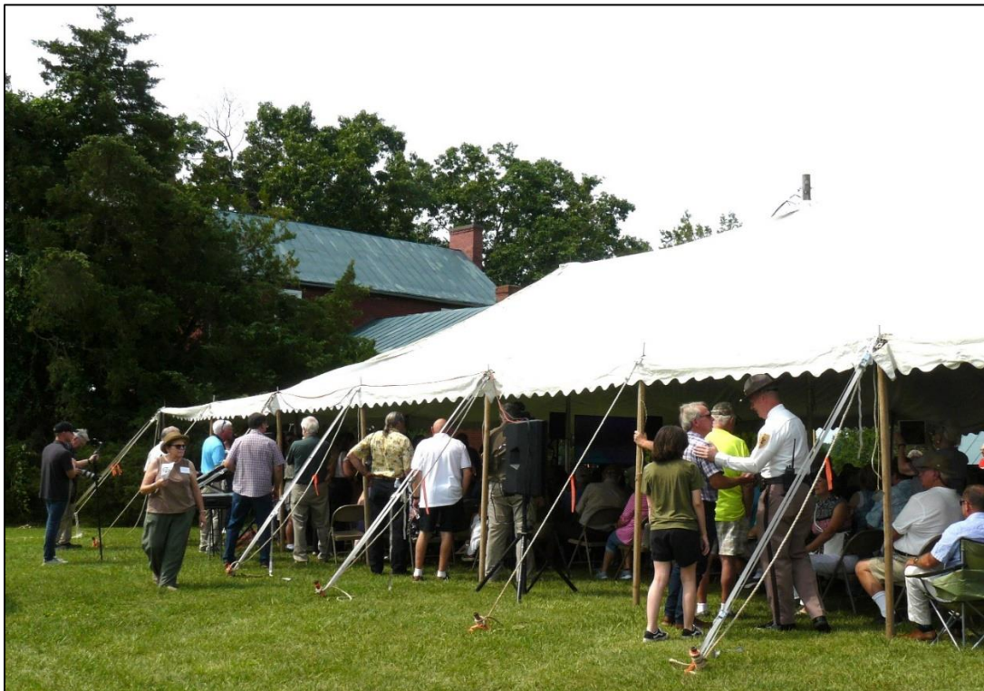
The large crowd finding seats before the program began