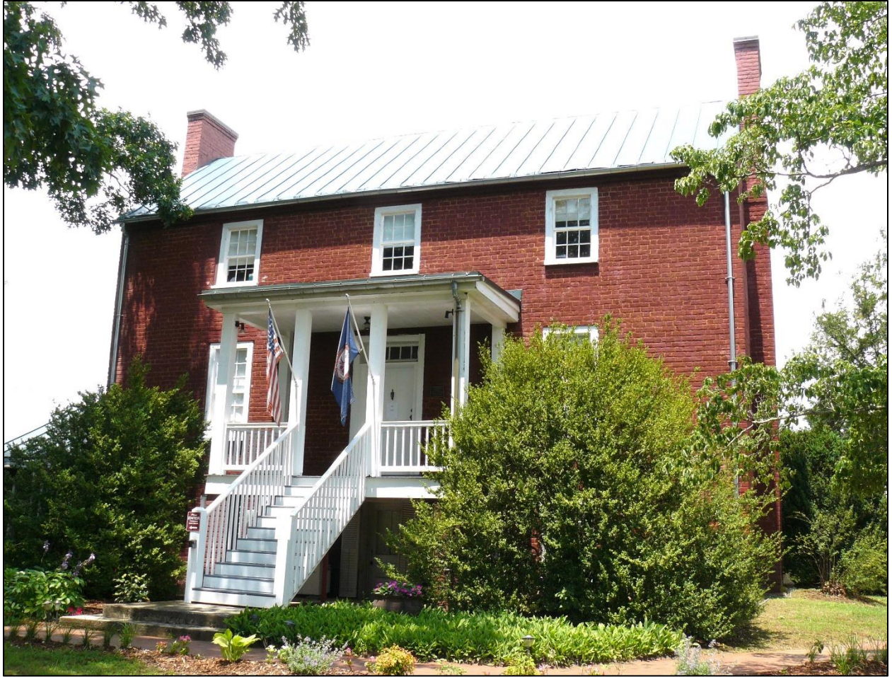
Historic Oakland Museum where the Hamner/Fortune statues reside

As the special day ended, everyone in attendance agreed it was the perfect tribute to two of Nelson County's most talented and revered men known around the world. I, for one, enjoyed every aspect of the celebration and was honored to capture the day in writing for the Nelson County Historical Society. I will end with Earl Hamner's words on the cover of my first book, Backroads, Plain Folk and Simple Livin'