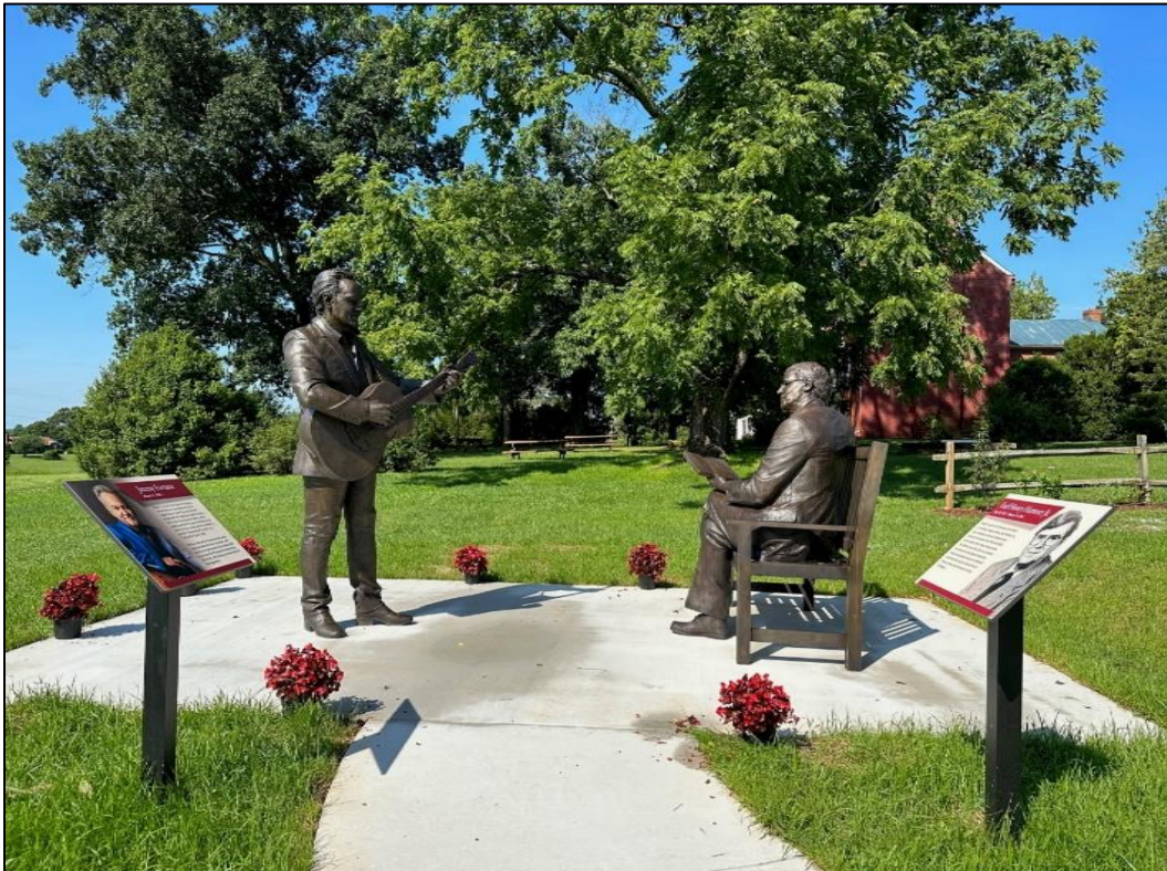
The Hamner/Fortune statues at Oakland Museum