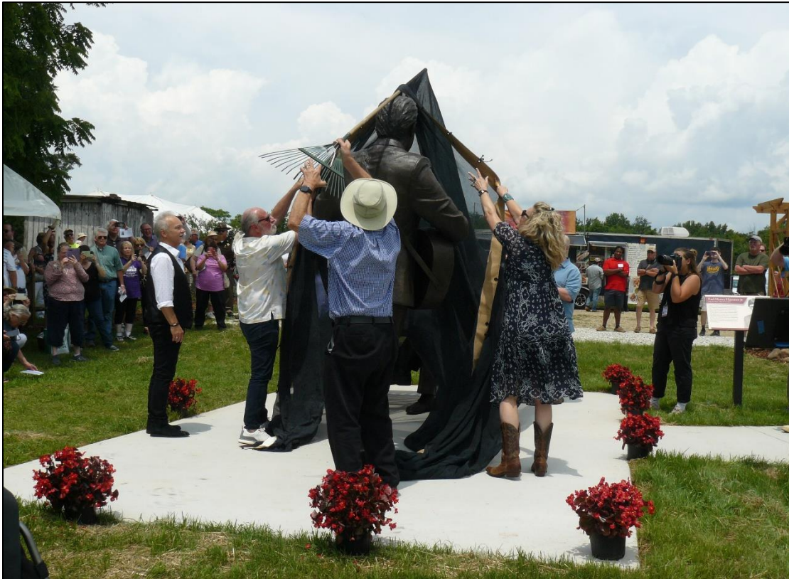
Unveiling the two statues before a large crowd