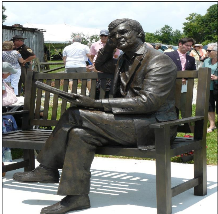
The Earl Hamner, Jr. statue

endorsement for a second book I was working