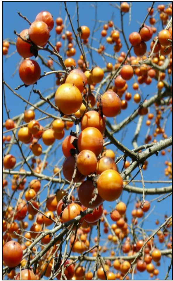
Closeup of persimmons still on the tree

“While visions of sugar-plums danced in their heads”. We are all familiar with the favorite poem, “Twas the Night Before Christmas,” but have you ever wondered exactly what ARE sugar-plums? Turns out the regional term refers to a succulent orange-colored fruit that ripens in the late fall months that usually coincide with several hard frosts.