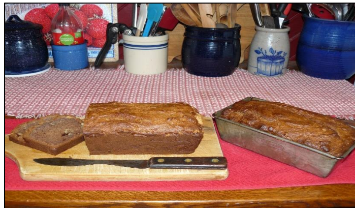
Loaves of persimmon-hickory nut sweet bread

Sift two cups regular flour and one teaspoon baking soda together. In a separate bowl, cream one cup of sugar and 1-1/2 sticks of butter. Add two well-beaten eggs and stir. Mix slowly with the flour and soda mixture. Add one-half pint (one cup) of persimmon pulp (extracted with a hand mill) and one-half cup hickory, black walnut or other nut meats and stir into a stiff batter. Pour into a well-greased loaf pan and bake at 325 degrees for one hour or until an inserted knife comes out clean. Cool on a wire rack for about ten minutes before removing from pan. All that's left to do is fix yourself a nice hot cup of tea, put your feet up and enjoy a slice of this delicious dark sweet bread made from "sugar plums!" Left: Pulp being extracted