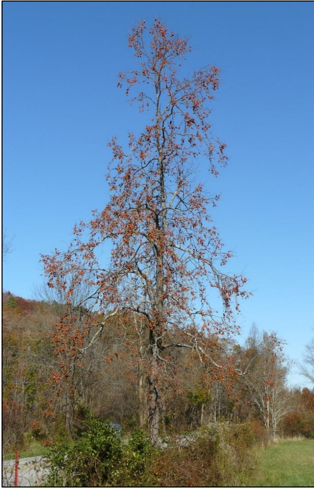
A persimmon tree loaded with fruit