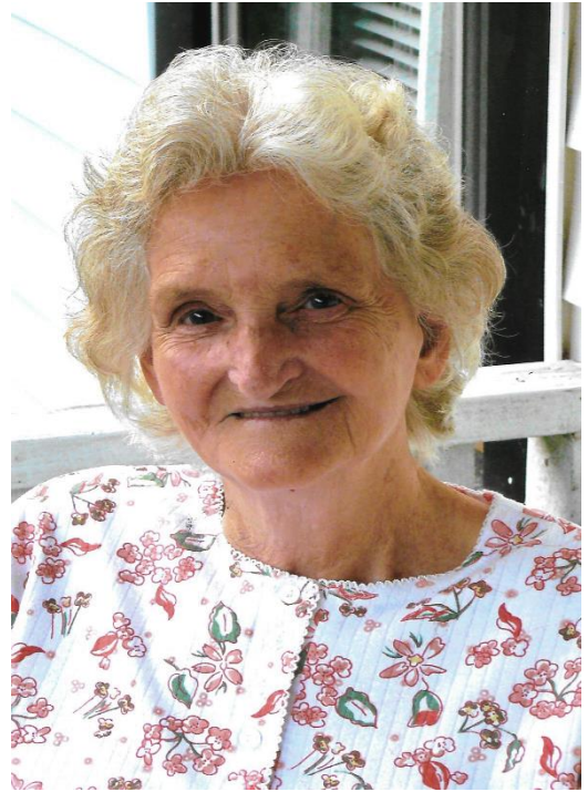
Vera Coffey Falls