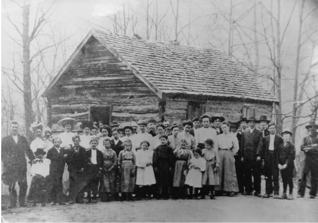
Ivy Hill School, early 1900s