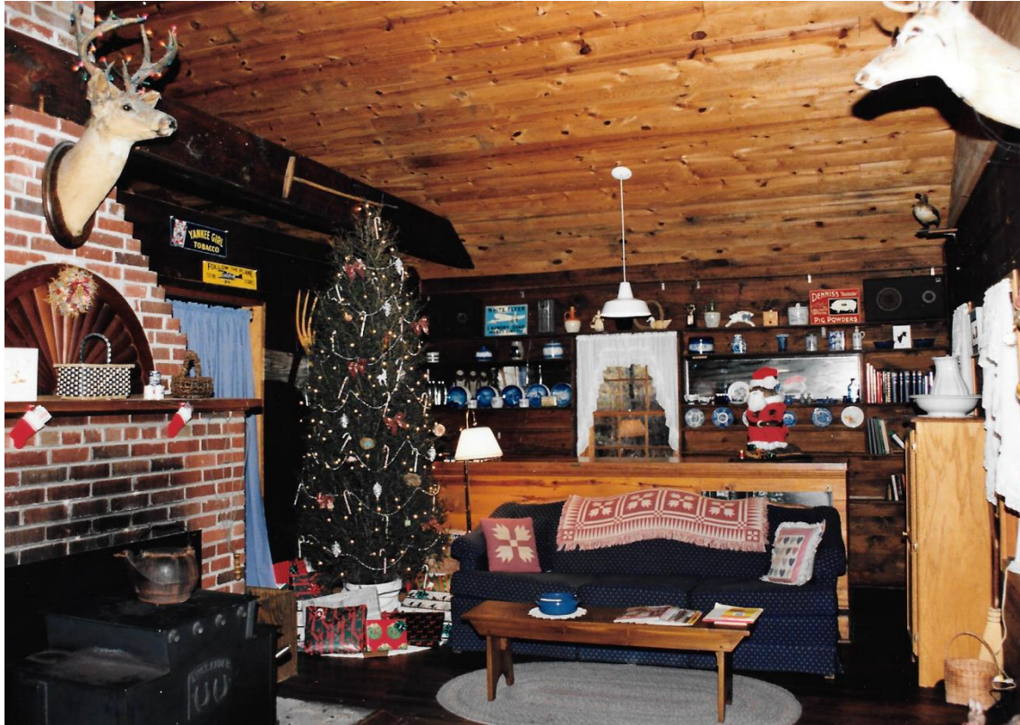
The large Christmas tree at the camp, decorated with homespun ornaments