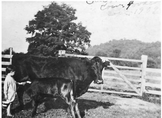
Unknown child & cows at Rosedale in 1909