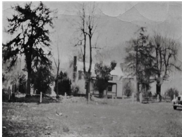
Photo of Rosedale in April of 1930