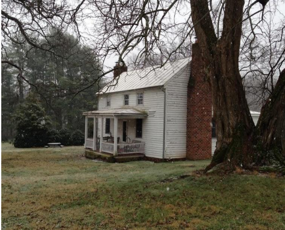
Late fall/early winter with snow beginning to fall