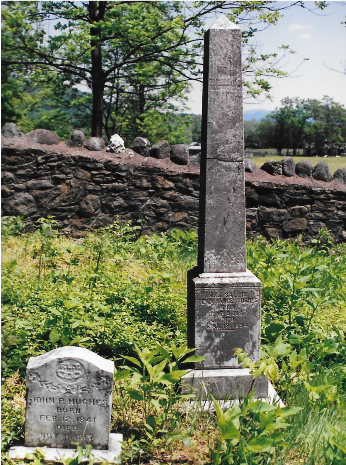
Another view of the grave stones inside the rock enclosure at the Hughes cemetery