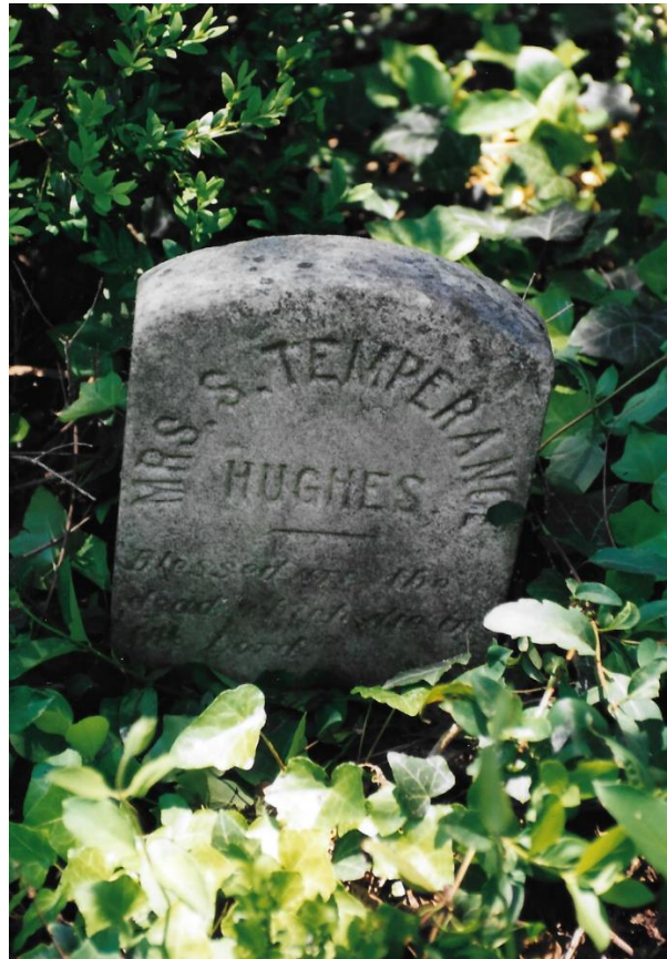
Sallie T. Hughes: 6/5/1847—1/19/1894