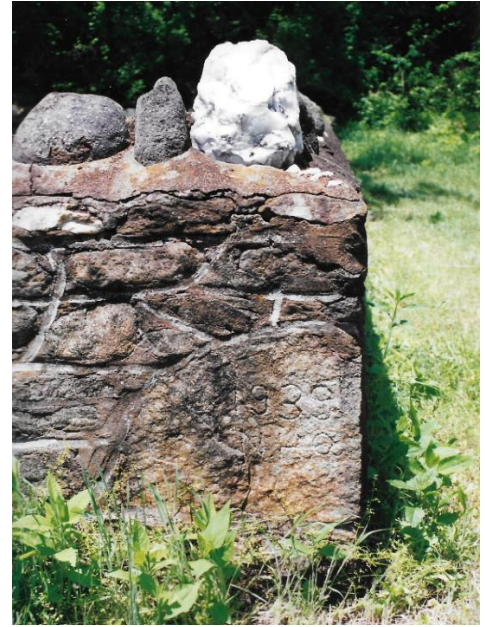
1939 rock cornerstone at cemetery

other structures in the area, was done by a man by the name of Hawthorne Quick, a well-known rock mason in the Beech Grove area