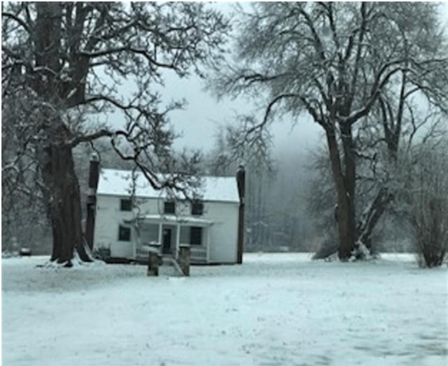
Fox Hill Farm in the solitude and beauty of winter