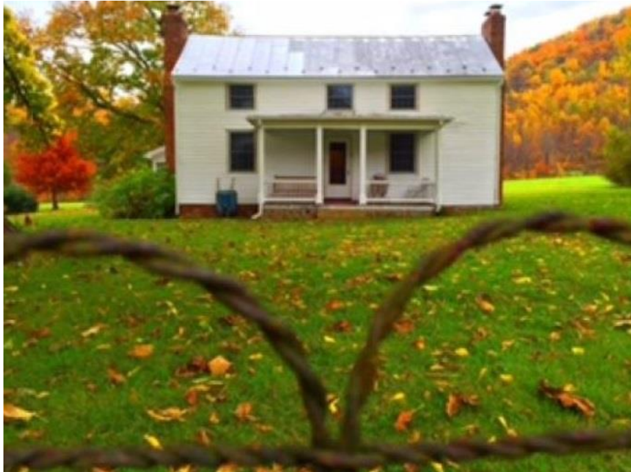
The old home in early autumn