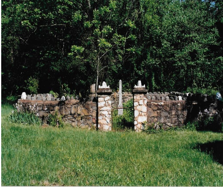
The Hughes graveyard rock wall by Hawthorne Quick