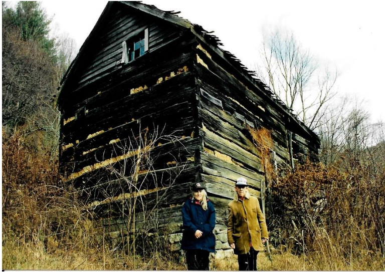
Stanley and Little Bell Cash's two-story log cabin

with stories of their childhood and I never forgot how much we learned that day.