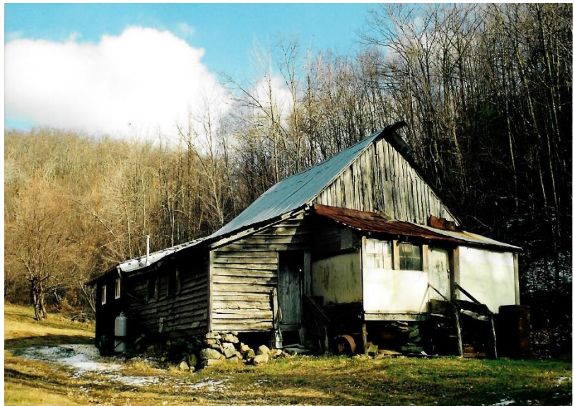
The Cash homeplace where the sisters were raised