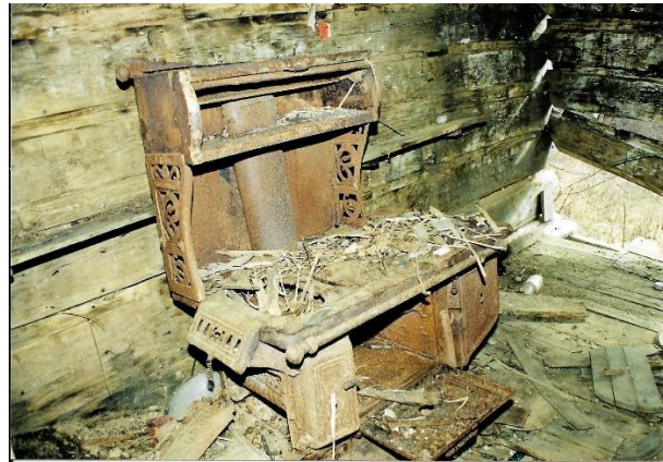
Remnants of a wood cookstove inside the cabin