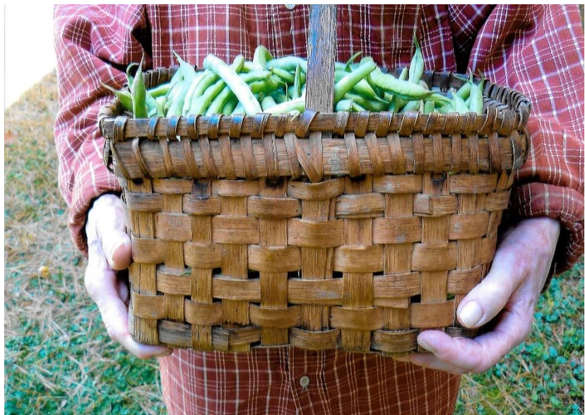
The rich patina shown on one of Cyrus Cash's baskets