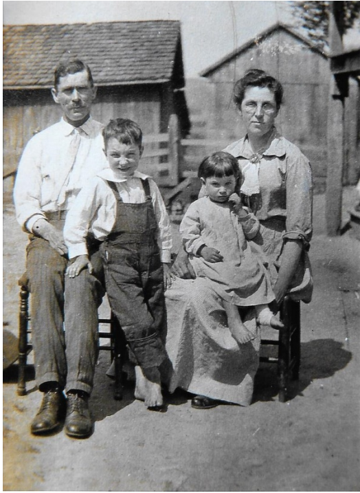
The Fox family circa, 1917