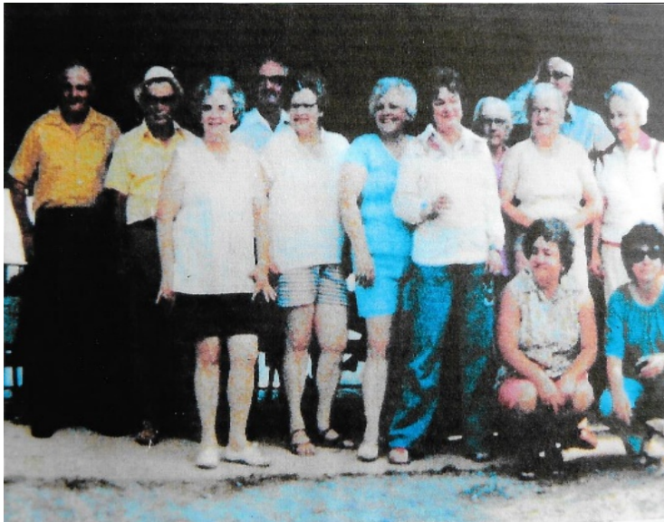
Miller family reunion with 13 of the 14 children